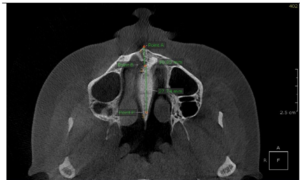
Figure 3. Midpalatal suture ossification in CBCT

Point A: Most anterior point of the premaxilla. Point B: Most posterior point on the posterior wall of the incisive foramen. Point P: The point of intersection between the MPS line and a line tangent to the posterior surface of permanent maxillary second molars. A–B: Anterior part, B–P: Posterior part