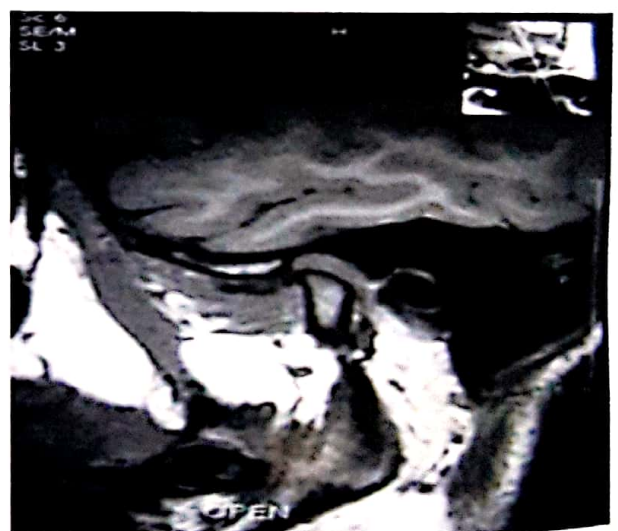
Fig. 3 - MRI sagittal view of condyle-disc complex in closed (left) and open position (Right) at irreversible status