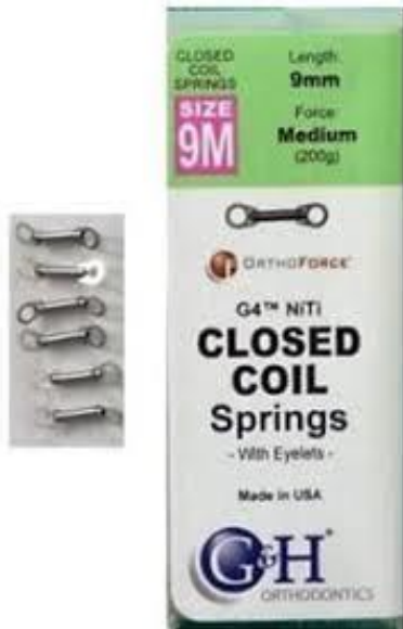
Figure 1. Nickel-titanium close coil spring (G&H, Franklin, USA)

on one side using the nickel-titanium close coil spring (G&H, Franklin, USA), as shown in Fig. 1 and on the other side using Super Slick Chain (TP Orthodontics) as presented in Fig. 2. To determine which side would be assigned to the control group (nickel-titanium spring) and which to the test group (Super Slick Chain), a random selection was done using the random block method.