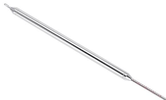
Figure 3. Tension and compression gauge (Dentaurum, Ispringen, Germany)

After the check-up on the start of retraction, patients were visited a total of three times in three months at one-month intervals. The measurement of space resulting from the extracted tooth in all cases and from the distolingual wing of the canine bracket to the mesiolingual wing of the second premolar bracket was done by a digital caliper (Insize, Suzhou New District; China; 111-100Y-070726) with a 0.01 mm accuracy at the beginning of retraction and the three other sessions of check-ups (Fig. 4). The measurement of spaces was repeated three times, and the mean of obtained numbers was chosen as final figures. Finally, the mean rate of space closure for nickel-titanium and Super Slick Chains was calculated based on millimeters per month, and the achieved data were statistically analyzed and compared.