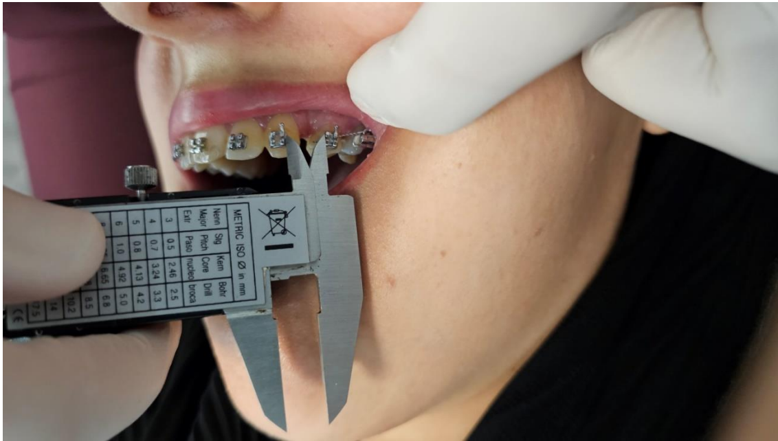
Figure 4. measurement with a digital caliper (Insize, Suzhou New District, China,111-100Y-070726)