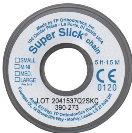
Figure 2. Super Slick Chain (TP Orthodontics)

The placement of closed coil springs and chains in the arches of the patients is explained. First, on the control side, a specific type of spring