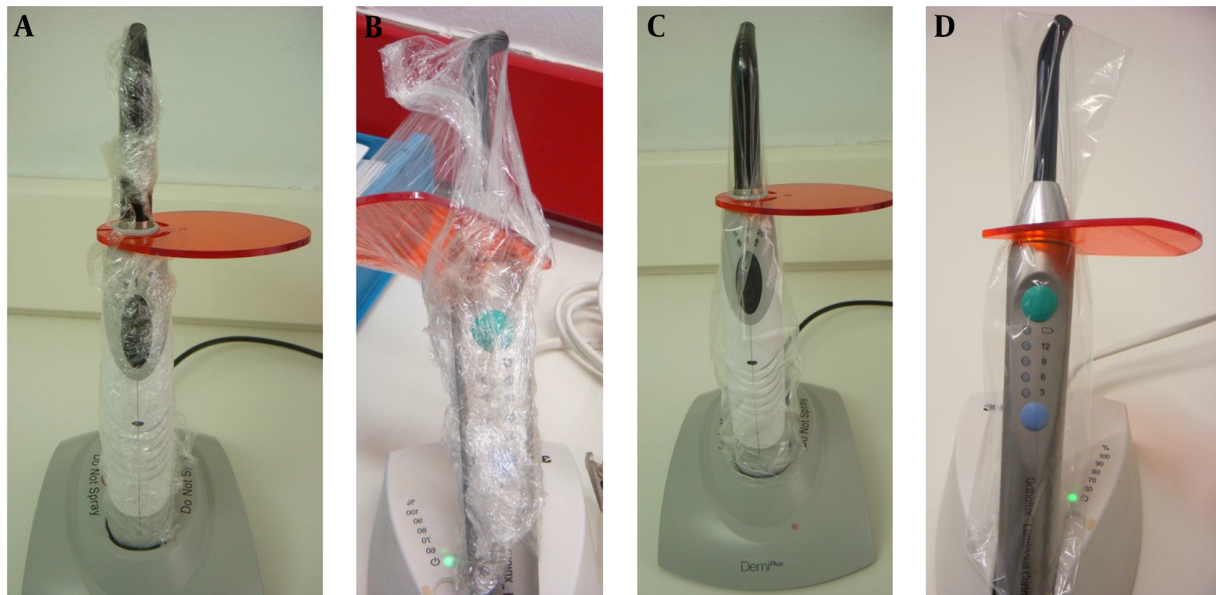
Figure 1. Disposable transparent food barriers (A,B) and purpose-made protective covering (C and D) are both handy against the significant bacterial contamination of curing lights, but the latter (C and D) give a smarter and more orderly look to an OF

Barriers must be pulled perfectly tight, be replaced regularly, removed safely and disposed as waste in compliance with National Laws. They should cause non-significant modifications of halogen lamps' emissions of light. To prevent contamination, curing lights selection should consider the "wand" design, whisper-quiet (A and C) or no fan (B and D), exterior made of smooth high-performance materials and control buttons located on the hand-piece. Protective light shield and protective glasses are needed.